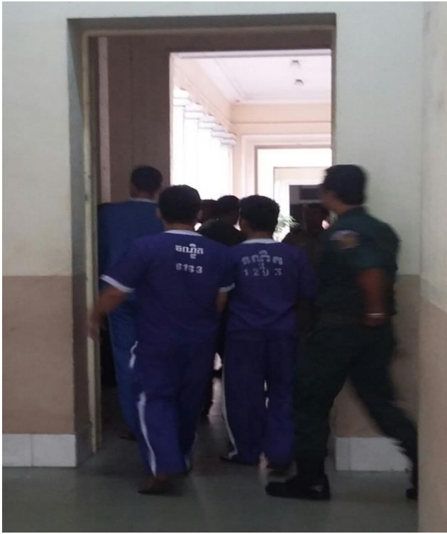
CCHR: defendants in convicts' uniform

even “the requirement that pre-trial detainees and convicts must wear jackets indicating their place of detention constitutes degrading treatment” and that the requirement to wear such jackets during trial may infringe on the presumption of innocence. 5